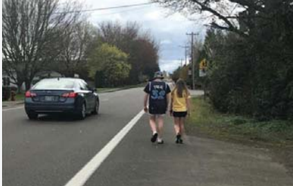
PEDESTRIANS WALKING ON ROAD SHOULDER